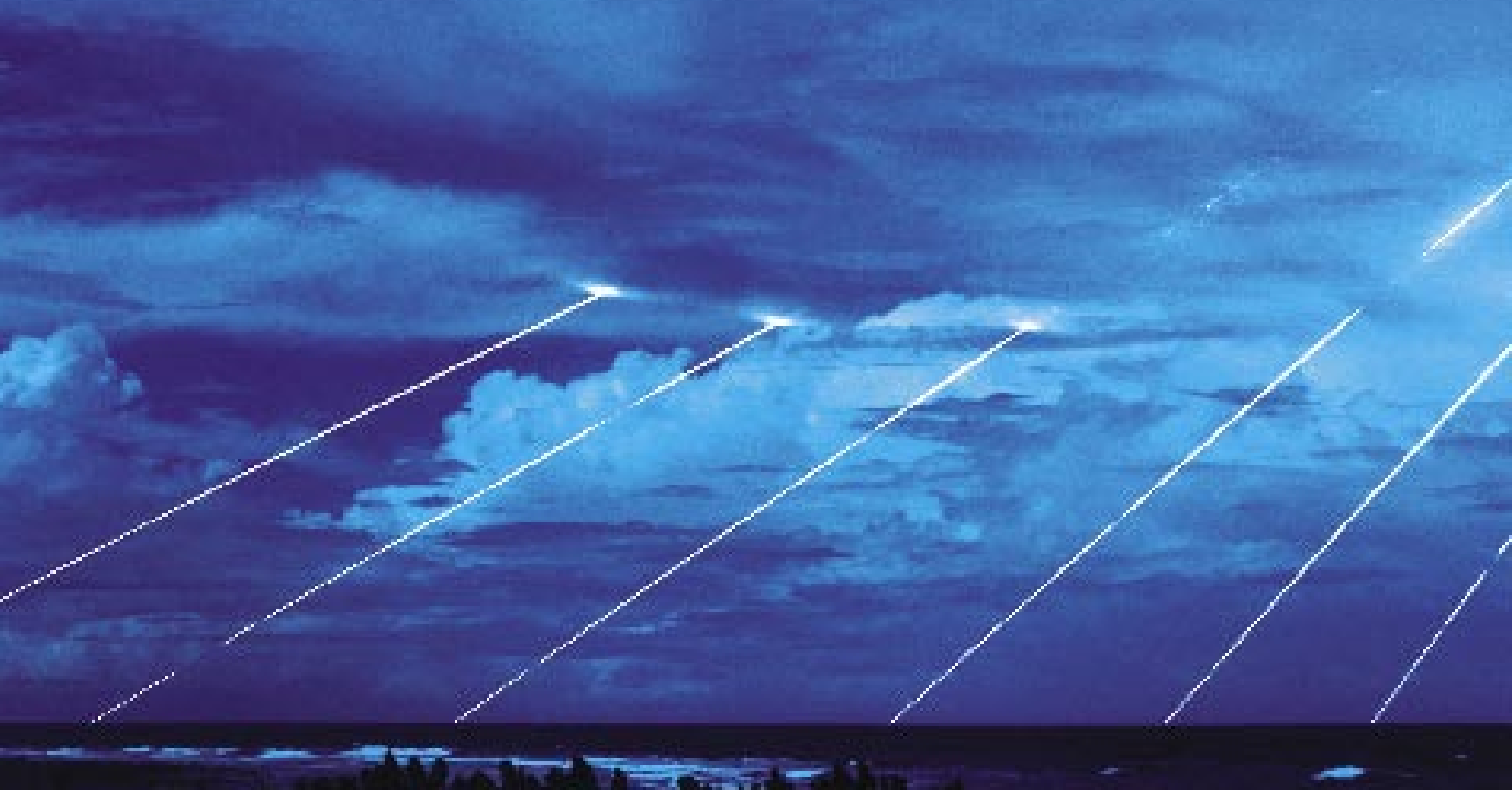
Pictured is the re-entry of eight test warheads carried by one Peacekeeper missile, such as the one pictured above (inset).

I N September, the Air Force deactivated its last remaining Peacekeeper ICBM, pulling the mammoth multiwarhead missile out of its Wyoming silo and sending it off to be dismantled. USAF once had maintained an awesome force of 50 LG-118A Peacekeepers; now there are none.