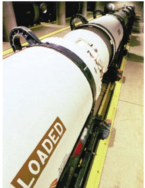
Refurbished Minuteman III engines await shipment from Hill AFB, Utah, where the reconditioning takes place. The fleet will be rebuilt from top to bottom to increase safety and reliability.

At present, Space Command officials are nearing the completion of an analysis of alternatives (AOA) evaluating options for a next generation land-based strategic deterrent. Space Command leaders are