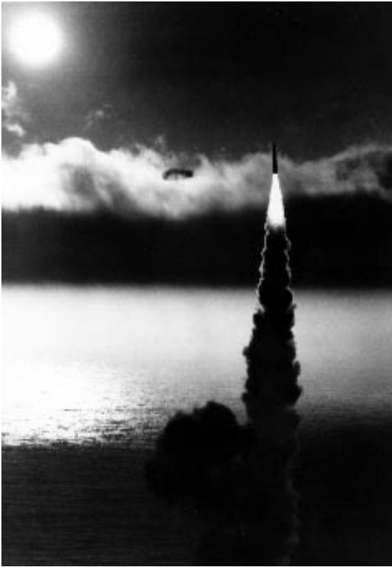
The 1970s-era Minuteman III (shown in test flight) will be the backbone of the US deterrent. USAF plans to keep 500 updated versions on station for years to come. Some will have one warhead, some three.