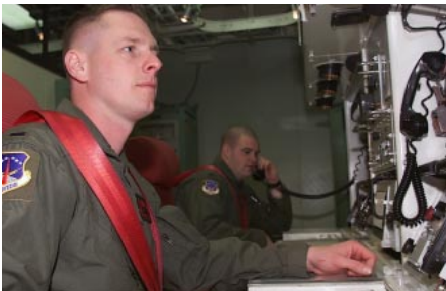
Two-person teams of company grade officers spend their 24-hour shifts monitoring ICBMs in hardened capsules roughly 65 feet underground. Each missile combat crew team oversees 10 missiles.