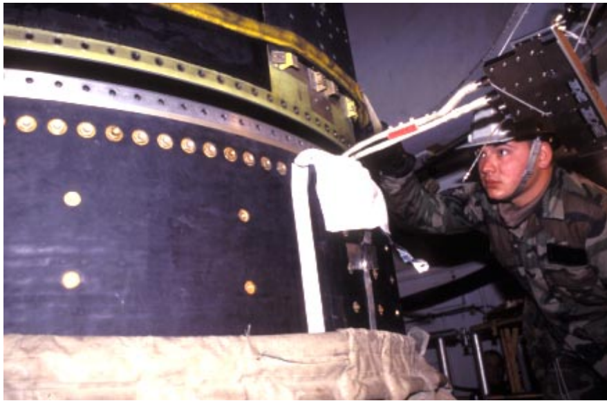
ICBM maintenance is continuous, so components are replaced before they have a chance to age out. Above, a maintainer checks the fit as two Peacekeeper sections are brought together.